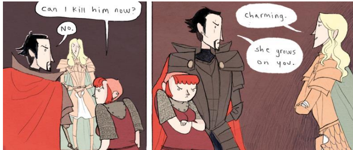
IMAGE 5: Will Nimona be able to help Lord Blackheart be the number one villain and ruler of the kingdom? Will she get to destroy to her heart's content? Will she manage to turn into a shark in every chapter?

IMAGE 4: And her unpredictable wild side might be more dangerous than he is willing to admit.