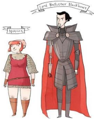
IMAGE 2: Their mission: prove to the kingdom that Sir Ambrosius Goldenloin and his buddies at the Institution of Law Enforcement and Heroics aren't the heroes everyone thinks they are.

IMAGE 1: Nimona is an impulsive young shapeshifter with a knack for villainy. Lord Ballister Blackheart is a villain with a vendetta. As sidekick and supervillain, Nimona and Lord Blackheart are about to wreak some serious havoc.