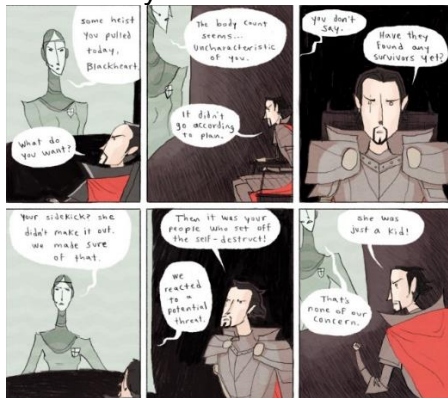
IMAGE 3: But as small acts of mischief escalate into a vicious battle, Lord Blackheart realizes that Nimona's powers are as murky and mysterious as her past.

IMAGE 2: Their mission: prove to the kingdom that Sir Ambrosius Goldenloin and his buddies at the Institution of Law Enforcement and Heroics aren't the heroes everyone thinks they are.