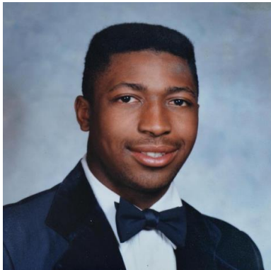
IMAGE 3: because you know now that Renisha McBride was shot for seeking help,

IMAGE 2: Eric Garner choked to death for selling cigarettes,