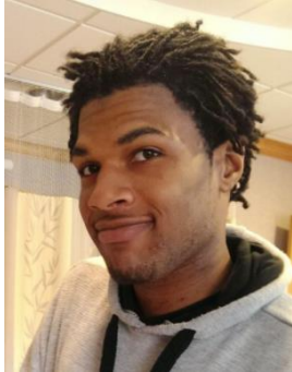
IMAGE 5: And you have seen men in uniform drive by and murder Tamir Rice, a 12-year-old child that they were oath bound to protect.

IMAGE 4: that John Crawford was shot down for browsing in a department store.