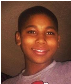
IMAGE 6: This is happening now. This title will resonate with all those who have experienced racism personally or seen it in the lives of friends or on the news.

IMAGE 5: And you have seen men in uniform drive by and murder Tamir Rice, a 12-year-old child that they were oath bound to protect.